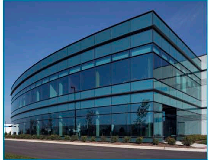
Vistacool Azuria glass combines with Sungate 500 glass to create energy savings as well as a lustrous aqua-blue sheen for the Bolingbrook, IL based glazing contractor, Frontrunner Glass & Metals.

Architect: Ekash Associates Glass Fabricator: Oldcastle Glass